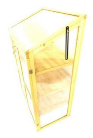
6. Screw N with J, screw M on B .

6. Screw on the open/close bar (N) using 1 screw (J) onto the lid (E), then screw the wing nut (M) into the prefixed nut on the side (B).